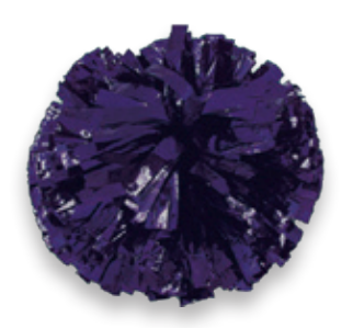
P175NN METALLIC 4" POMS $11.00