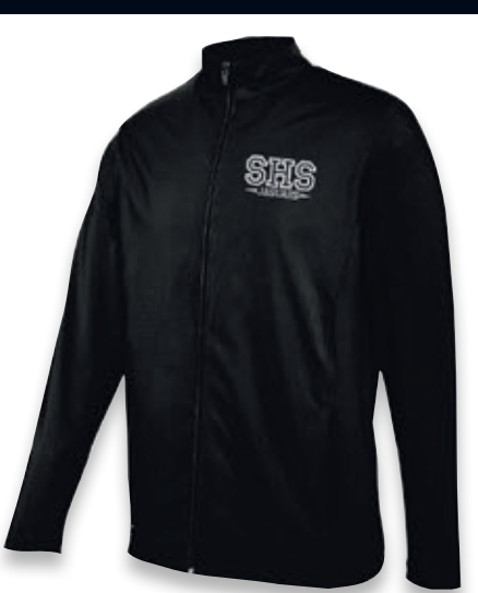
1510TU MEN'S ABSOLUTE JACKET $39.00 S-3XL $39.00 S-L (Youth)